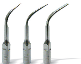
TA1 TA2 TC

* All of the above tips are included with each unit